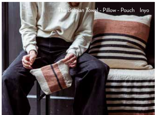
The Belgian Towel - Pillow - Pouch Inyo