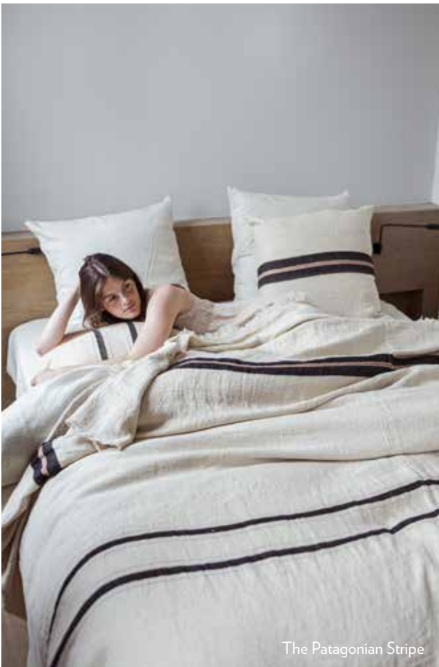
The Patagonian Stripe